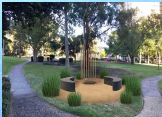
Impression of what the Stolen Generations marker will look like at its location in Atherton Gardens, Fitzroy