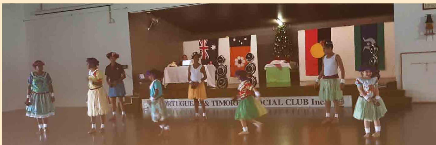
Young Torres Strait Islander dancers Upai-Puri-Puri group