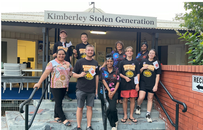
Xavier College Students and Staff