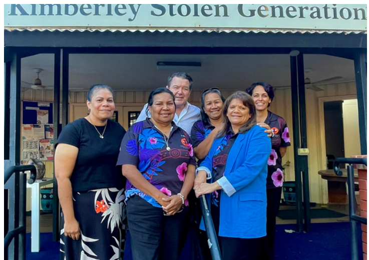
KSGAC Staff with Senator Dean Smith - Meeting regarding National Redress Scheme