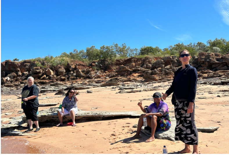
Womens Well-Being Group enjoying outing at Crab Creek