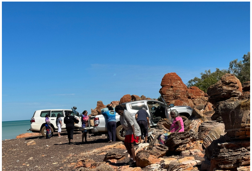
Womens Well-Being Outing at Crab Creek