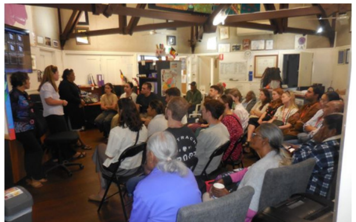
University of Notre Dame, Medical Students