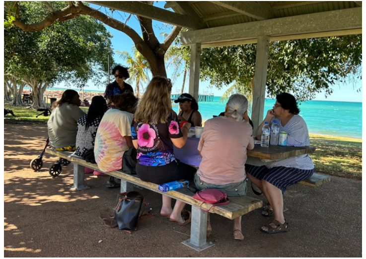
Womens Wellbeing Group at Town Beach outing