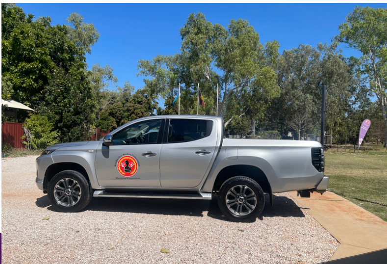
Thank you, Kimberley Auto Care, for the detail cleaning on our fleet!