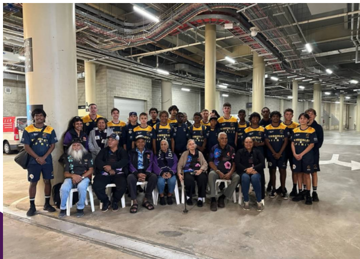
Stolen Generation Elders with Kimberley Spirit team at National NAIDOC Dockers Game - Fremantle, Perth