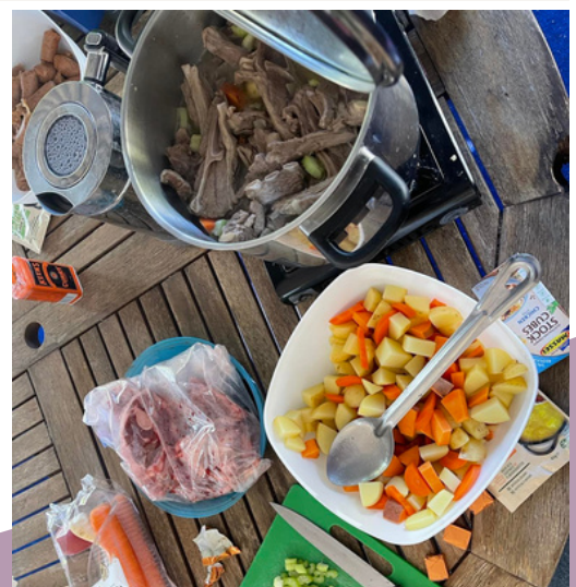
Healing Arts Soup Day preparation