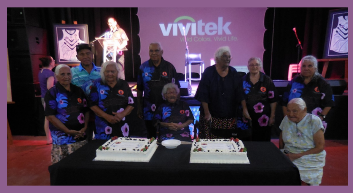
We acknowledge Aboriginal people as the Traditional Custodians of this land and its waters. We pay respect to Elders both past and present of the Aboriginal Nations of Australia and extend that respect to all Aboriginal people who may read this message.

Whadna you mob! The year of 2023 has been speeding past us fast go's. Check out what October had installed for us at KSGAC.